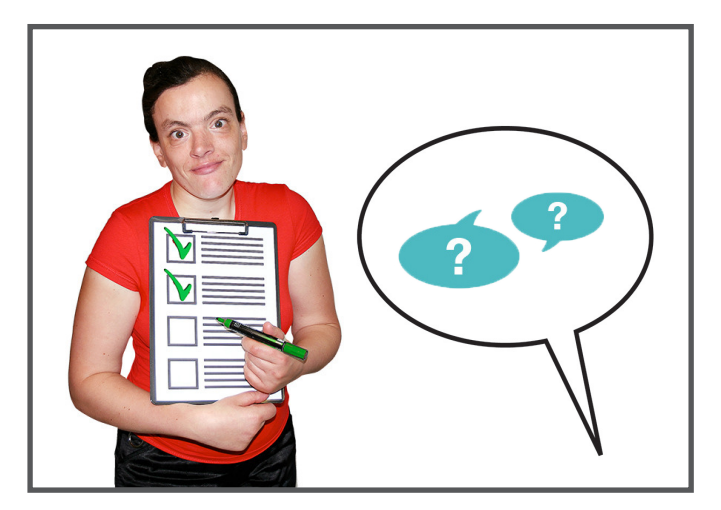
Safe: We have a duty to keep you and other people safe from harm and we learn how to do this well.

Effective: We check with you and other people that your care and support is meeting your needs. We make sure we are doing things well for you.