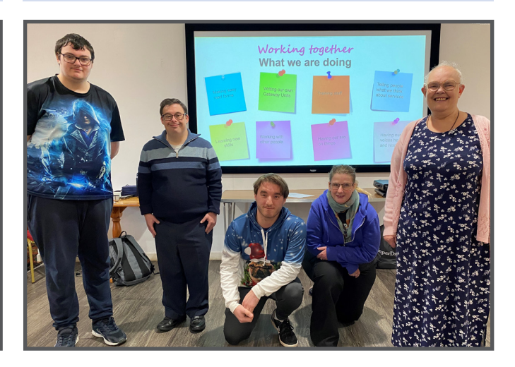
We will support you to do the things you choose and help you to learn new skills.

We will train our staff on Safeguarding. Safeguarding means that we learn about how to keep you and other people safe.