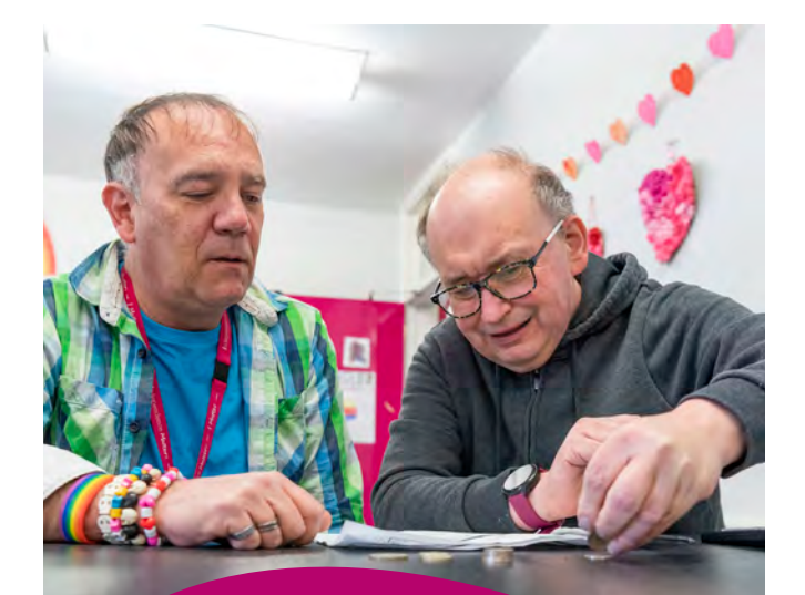
Our aim is to support you to live the life you choose.

This pack contains information about our range of services. You may be joining us in one of our community hubs where there are a wide range of activities on offer or working with a personal assistant to access your community. You may be moving into one of our