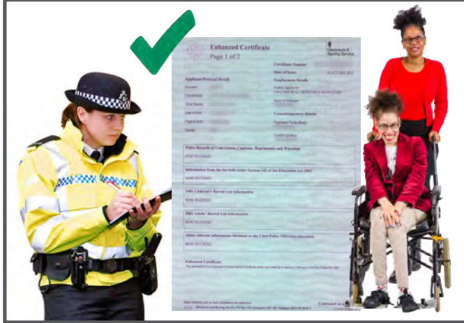
We will make sure that all staff have a DBS which means that they are checked to see if they have a criminal record before they start supporting you.

We will communicate with you and your carers in a way that meets your needs