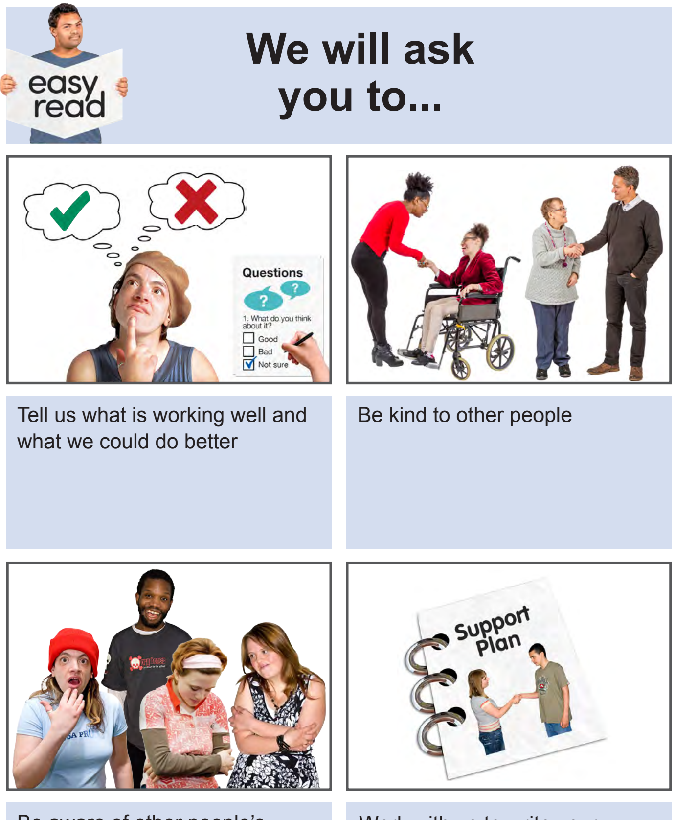
Be aware of other people's feelings as to not upset anyone