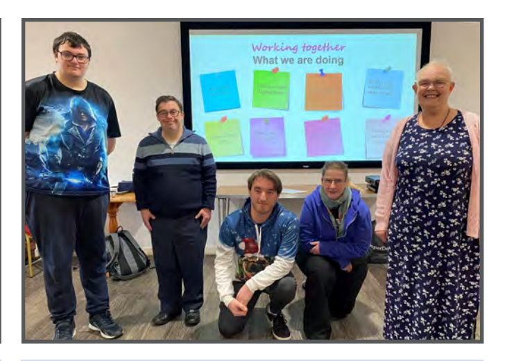
We will support you to do the things you choose and help you to learn new skills.