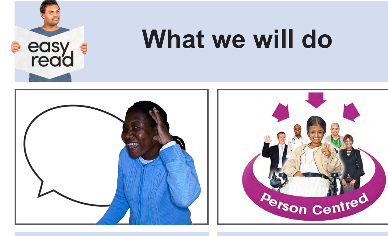
We will listen to you and respond to you quickly and positively.