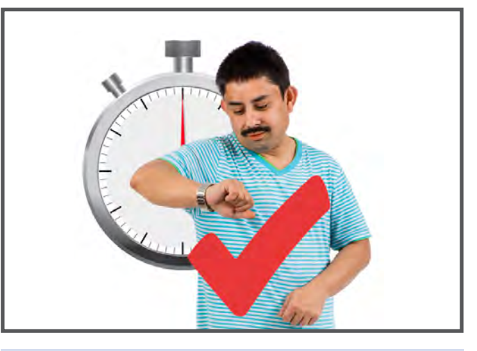
Responsive: We can change your support quickly if you need us to.

Effective: We check with you and other people that your care and support is meeting your needs. We make sure we are doing things well for you.