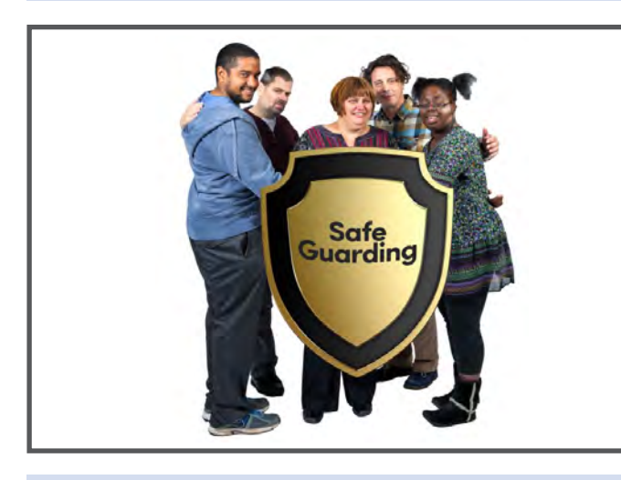
We will train our staff on Safeguarding. Safeguarding means that we learn about how to keep you and other people safe.