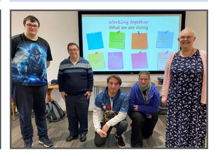
We will support you to do the things you choose and help you to learn new skills.

We will train our staff on Safeguarding. Safeguarding means that we learn about how to keep you and other people safe.