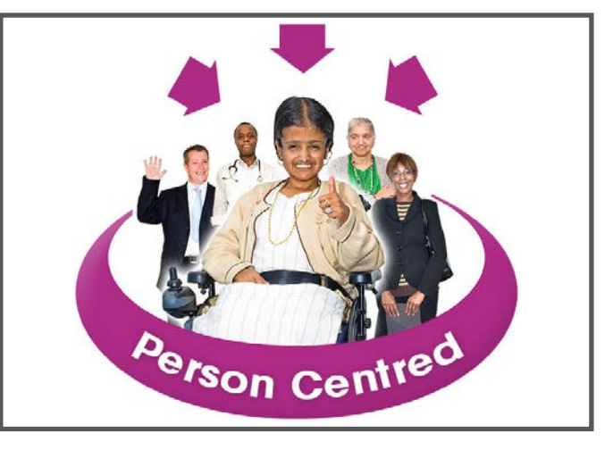
We will treat you with dignity and respect by giving you person centred care and support in the way that you choose.