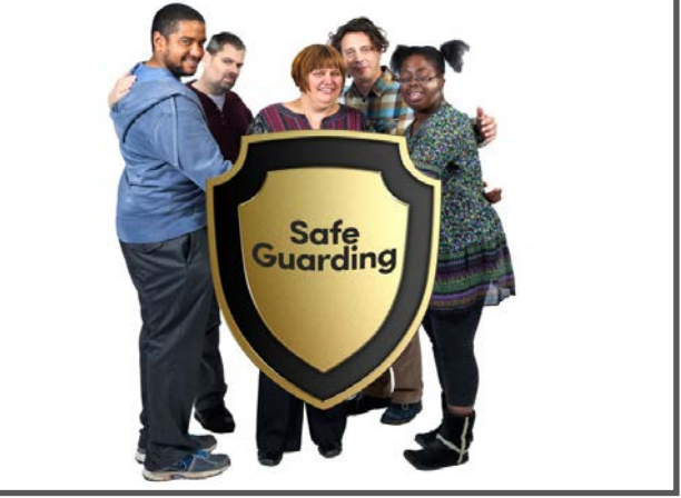
Safe: We have a duty to keep you and other people safe from harm and we learn how to do this well.

Well Led: We support you in a way that matters to you. We are reliable, trusted and give you the best quality care and support.