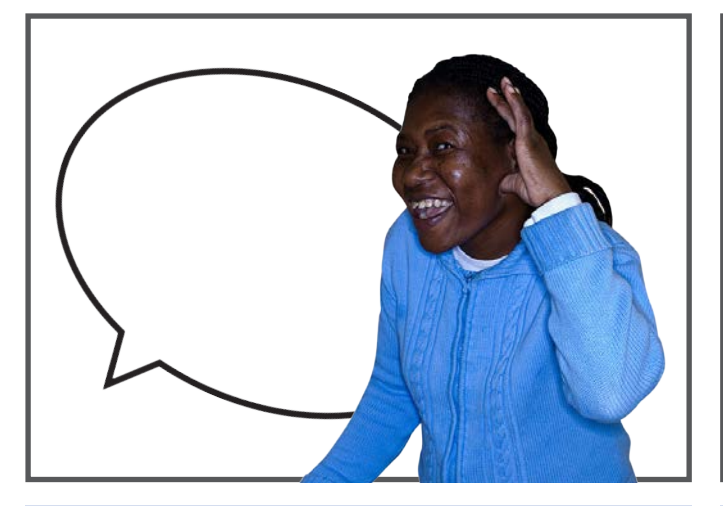
We will listen to you and respond to you quickly and positively.