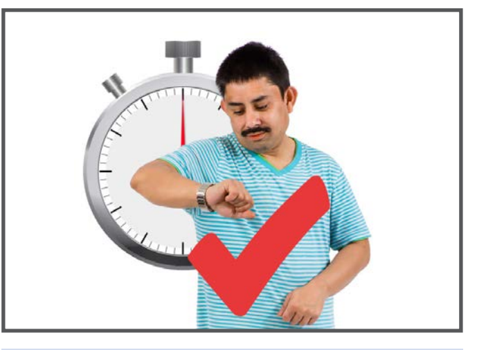
Responsive: We can change your support quickly if you need us to.

Effective: We check with you and other people that your care and support is meeting your needs. We make sure we are doing things well for you.