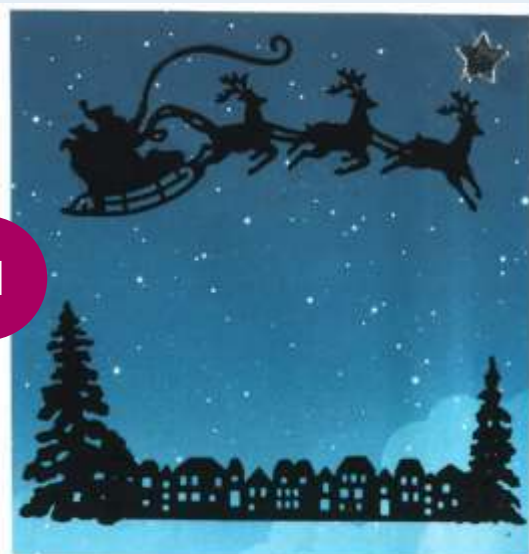
Sandie, Crossroads Community Hub