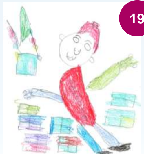
Jimmy, Great Yarmouth Community Hub