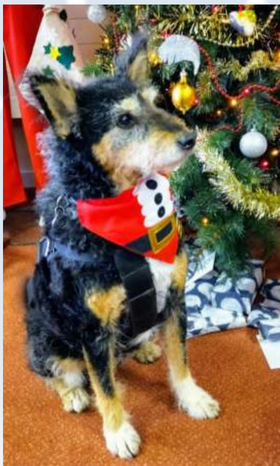
Next door, customers at Ipswich Road Community Hub (right) enjoyed a Christmas story time party with interactive signing, presents, nibbles, laughter and joy.