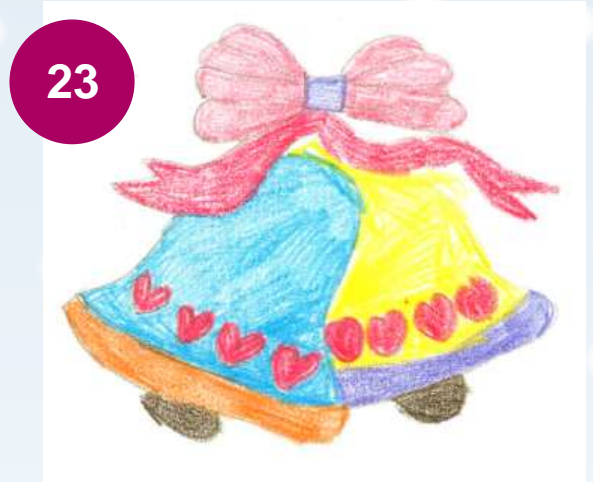
Winner Carol, Ipswich Road Community Hub