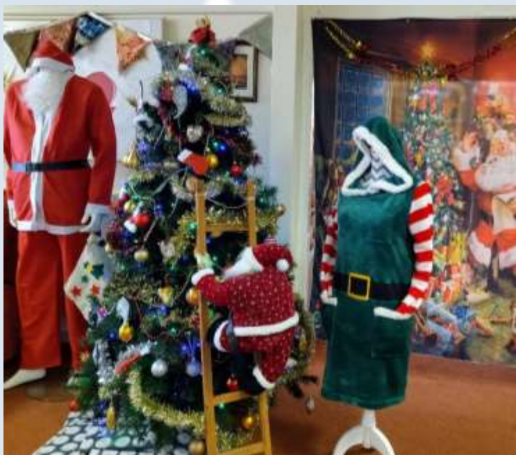
Harford Hill looks equally festive inside with this lovely display (above) and of course Buffy helping everyone to get into the Christmas spirit! .