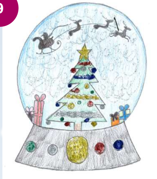
Tobias, Ipswich Road Community Hub