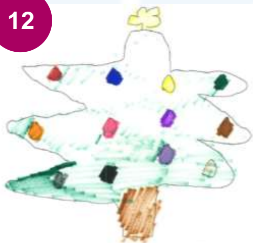
Ben, Ipswich Road Community Hub